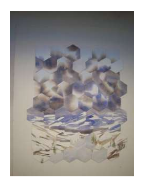
All glued down.