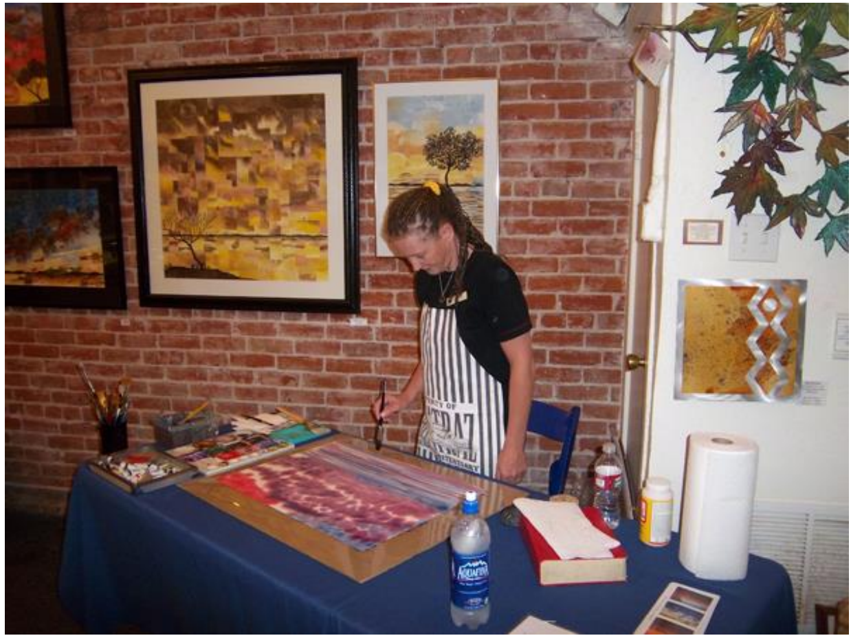
This is the 6th iteration of this scene that I have painted. I like three of them and I will use them for the collage.