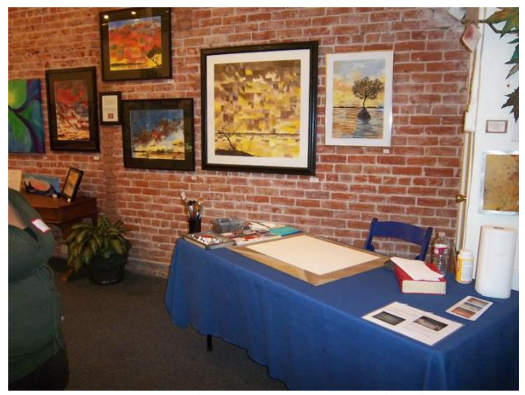
Work Area in the corner next to my space on the wall

Here are some pics during the demo of a watercolor collage, taken at Red Brick Gallery in Ventura, during the reception for the "Fresh" group show.