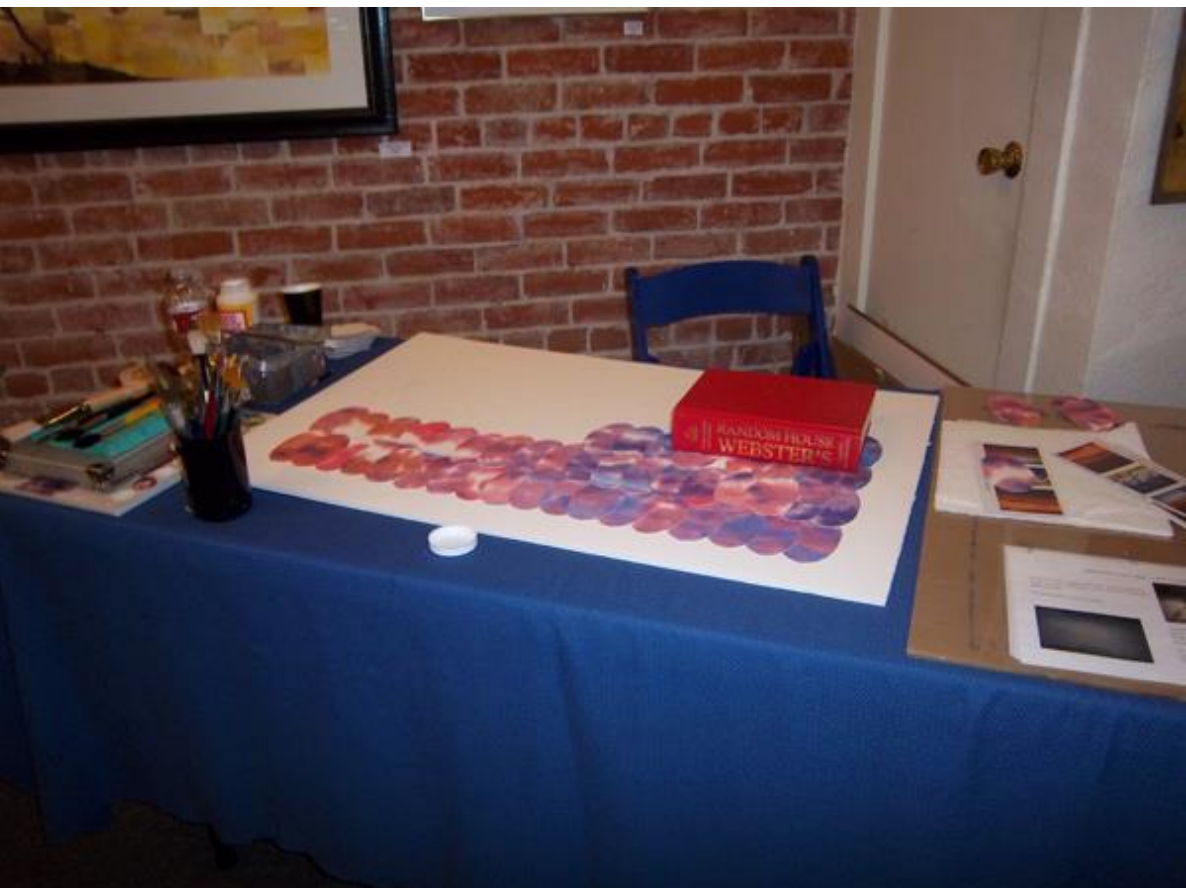
The Dictionary Stage. After putting down the pieces, I then lift each one in order and mark where it should go. Then glue them in reverse order. The dictionary is holding down the ones I've just glued.