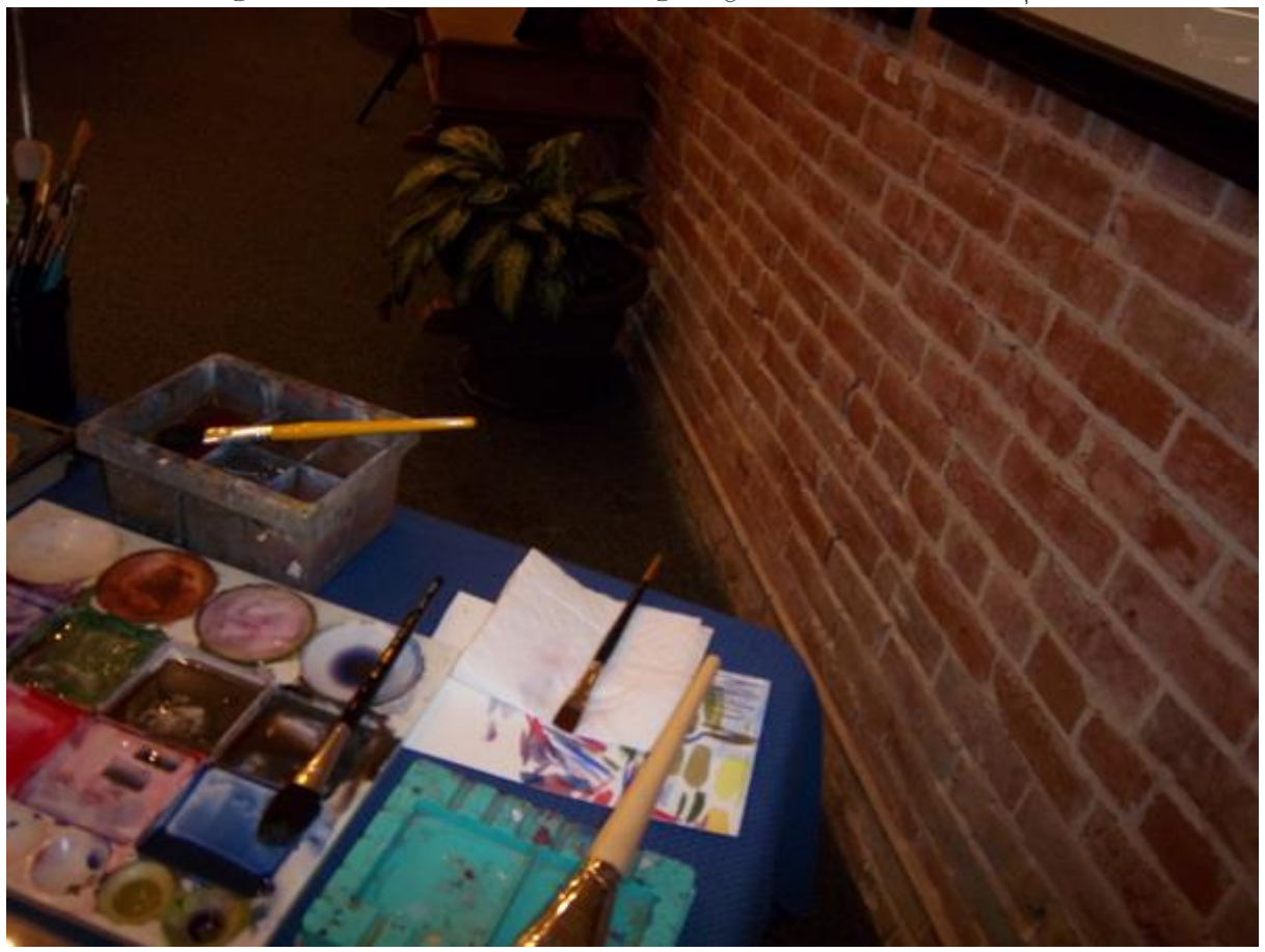
Ready, Set.... I have mixed some of the colors at this point.