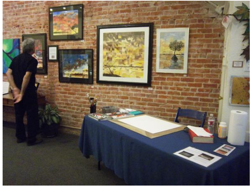
A customer gives some close examination to one of the collage - and the info sheet.