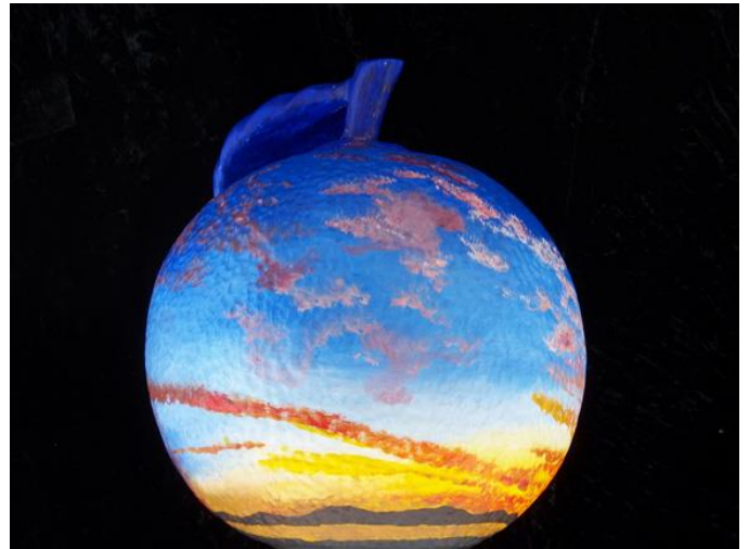
The north-east aspect.