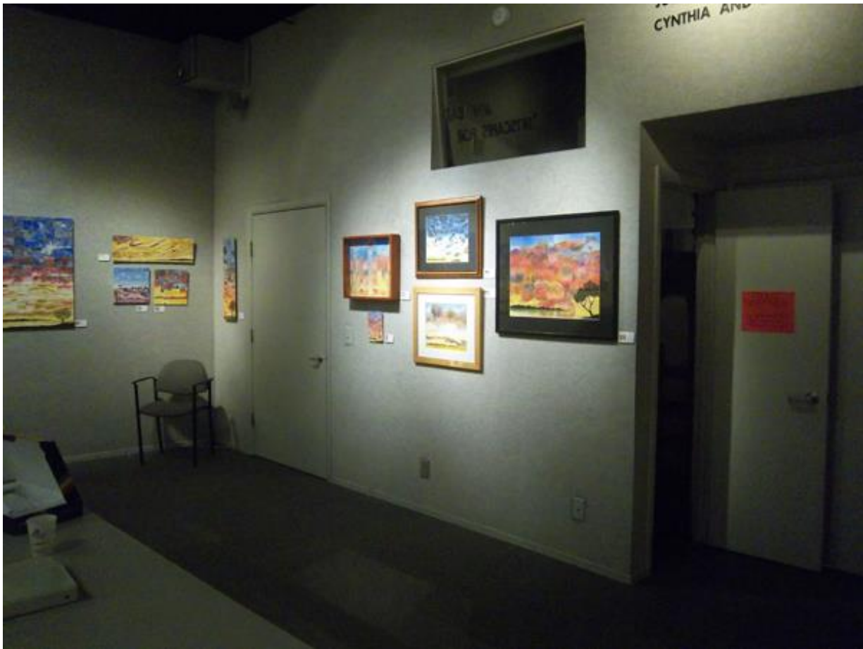
Below - setting up for the talk